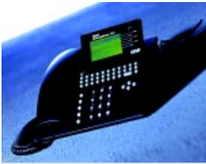
In action at Deutsches Forschungsnetz: IP Phone IP 200

the Internet protocol. In Stuttgart, on the other hand, the existing Alcatel telephony system was kept on in a switched circuit with an innovaphone IP 3000 gateway. This latter migration scenario, also known as "soft migration," is a low-cost, future-oriented version, as existing maintenance contracts may be fulfilled while simultaneously, the advantages of state-of-the-art technology can be profited from.