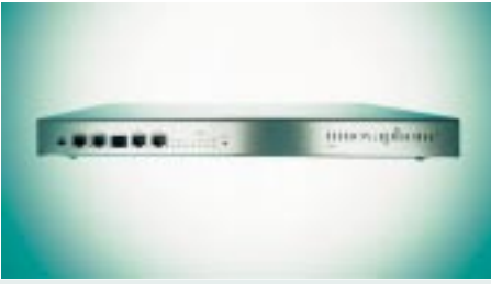
In action at Deutsches Forschungsnetz: IP 3000

In addition to a number of functions also available with ISDN telephony, voice-over IP offers a range of organizational features that traditional telephony can't. These include switching across locations and caller groups with participants at different locations. Another advantage of IP telephony is its easy integration into video conferencing setups. As video conferencing is crucial in today's scientific communications, and as the DFN association's service caters to the needs of the scientific community, integrating IP telephony structures and components into the existing video-conferencing environment is a high priority.